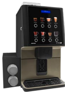
Cup module kit For dispensing cups.