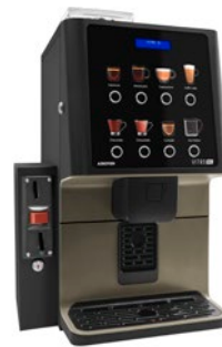
Validator module kit Ready to install a coin validator.