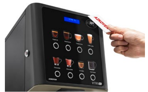
RFID Reader Kit For product recharge card or cashless systems