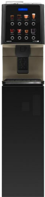
Base cabinet kit Ready to install a coin validator.

It offers a pleasurable experience with an attractive, simple and functional design.